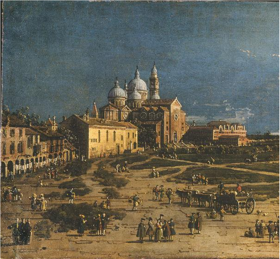
Canaletto, Il Pra della Valle in Padova , 1741-1746, oil on canvas, Milan, Poldi Pezzoli Museum (detail)