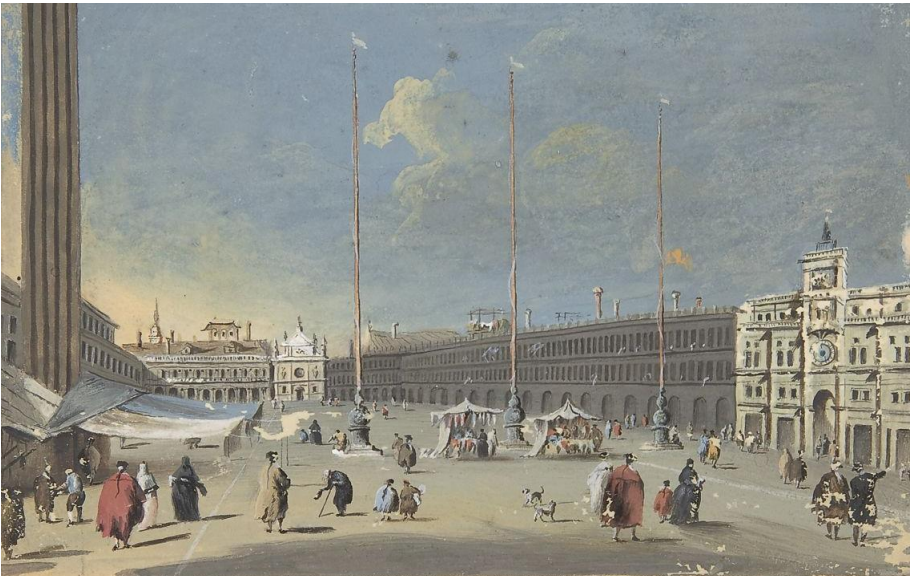
Giacomo Guardi (attrib.), The Piazza San Marco towards San Giacomo , 1764–1835, brush and gouache